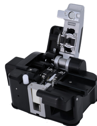
Wide Lid Angle for Easy Opening